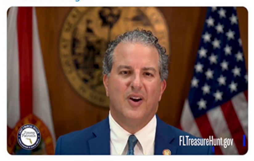
9:20 AM - Jul 27, 2020 - Twitter for iPhone

II BIG NEWS II We've returned a record $ 11 BILLION in Unclaimed Property to Floridians since I became your CFO. I cannot thank my team at @FLDFS enough for their hard work. Start your search NOW at FLTreasureHunt.gov!