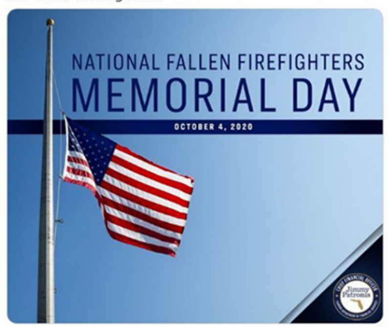
8:50 AM · Oct 4, 2020 · Twitter for iPhone

My prayers today are with the families of fallen firefighters from across our country as we honor the memory of these heroes who made the ultimate sacrifice. These brave men & women gave everything to keep our communities safe & their service & sacrifice will never be forgotten.