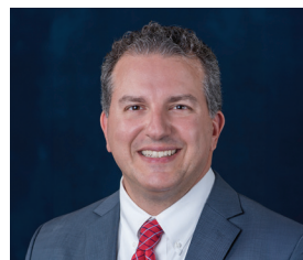
CFO JIMMY PATRONIS

BUREAU OF DEFERRED COMPENSATION 200 East Gaines Street, Tallahassee, FL 32399 Toll-Free: 877-299-8002 | Local: 850-413-3162 | Fax: 850-488-7186 MyFloridaDeferredComp.com | DeferredCompensation@MyFloridaCFO.com