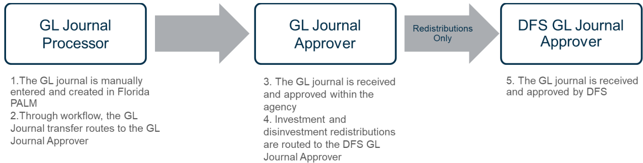
Figure 3: GL Journal Approval Workflow Steps

Workflow occurs between the GL Journal Processor role (assigned to an end user within an agency Business Unit), the GL Journal Approver role (assigned to an end user within an agency Business Unit), and the DFS GL Journal Approver role (assigned to an end user within the DFS Business Unit). The process steps for this workflow are documented in Figure 3.