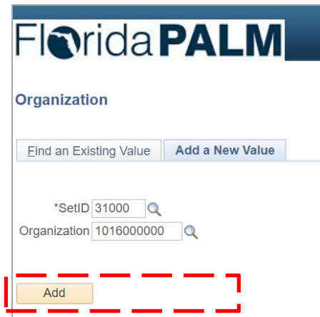
Figure 2: Organization Configuration Page

NOTE: Additional Organization related fields displayed in the example configuration page screenshots below are not listed in the General Ledger (GL) Organization worksheet and will not be used in Florida PALM.