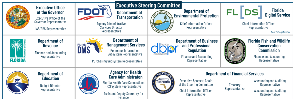
Figure 1: ESC Membership