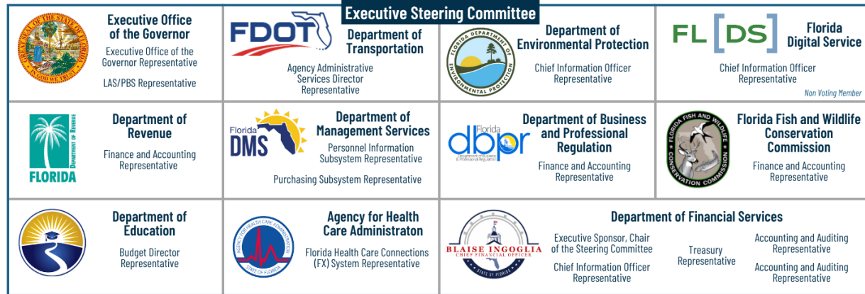
Figure 1: ESC Membership

The following represents the interaction between the ESC, the Project team, and external stakeholders. Business and Project Sponsors attend ESC meetings. An Advisory Council gives feedback and options to the ESC for decision-making. External stakeholders attend ESC meetings during applicable Project activities (i.e., production updates, enterprise activities, requirements/business process updates, testing activities) or upon request.