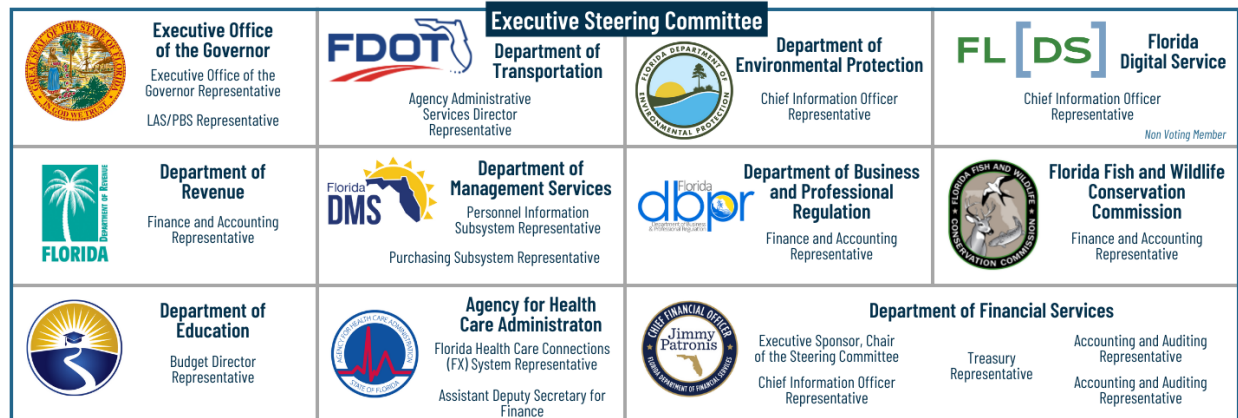
Figure 1: ESC Membership