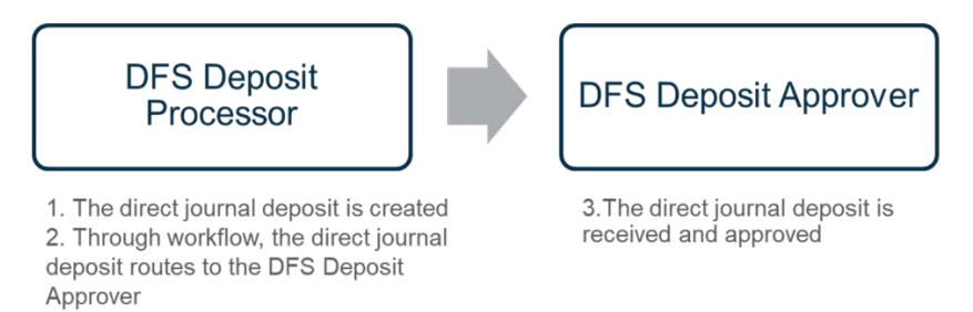
Figure 2: DFS Deposit Approval Workflow Steps

Workflow occurs between the DFS Deposit Processor role and the DFS Deposit Approver role. The process steps for this workflow are documented in Figure 2.