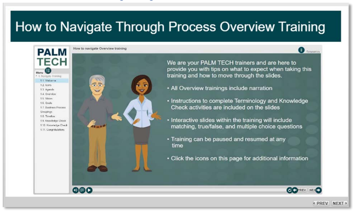
Figure 2: How to Navigate Through Process Overview Training