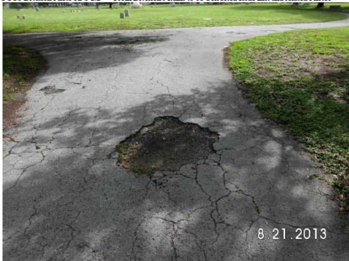
FCCS Division Photo RPS 2.2 -- From Division's Items to be Corrected Issue List and related Photos