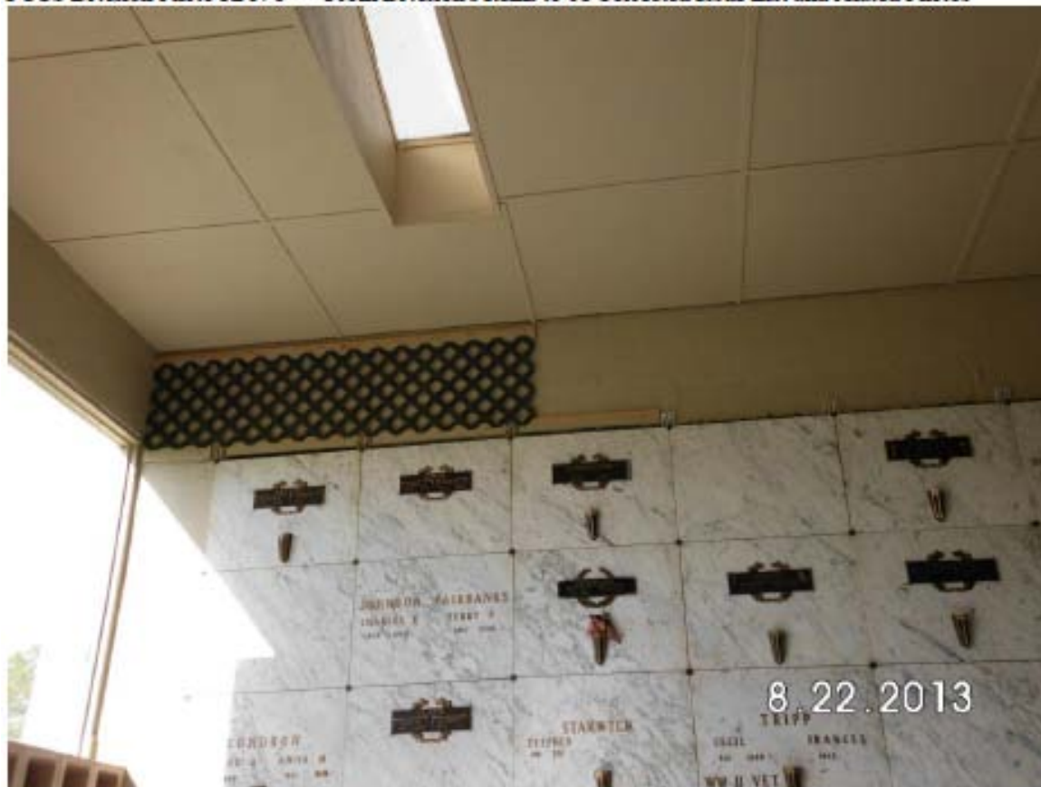
FCCS Division Photo RPN 1 -- From Division's Items to be Corrected Issue List and related Photos