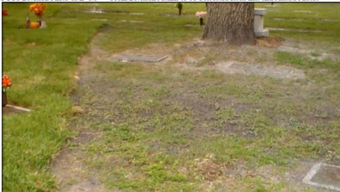
BFCCS Division Photo SMP 1.1 -- From Division's Items to be Corrected Issue List and related Photos