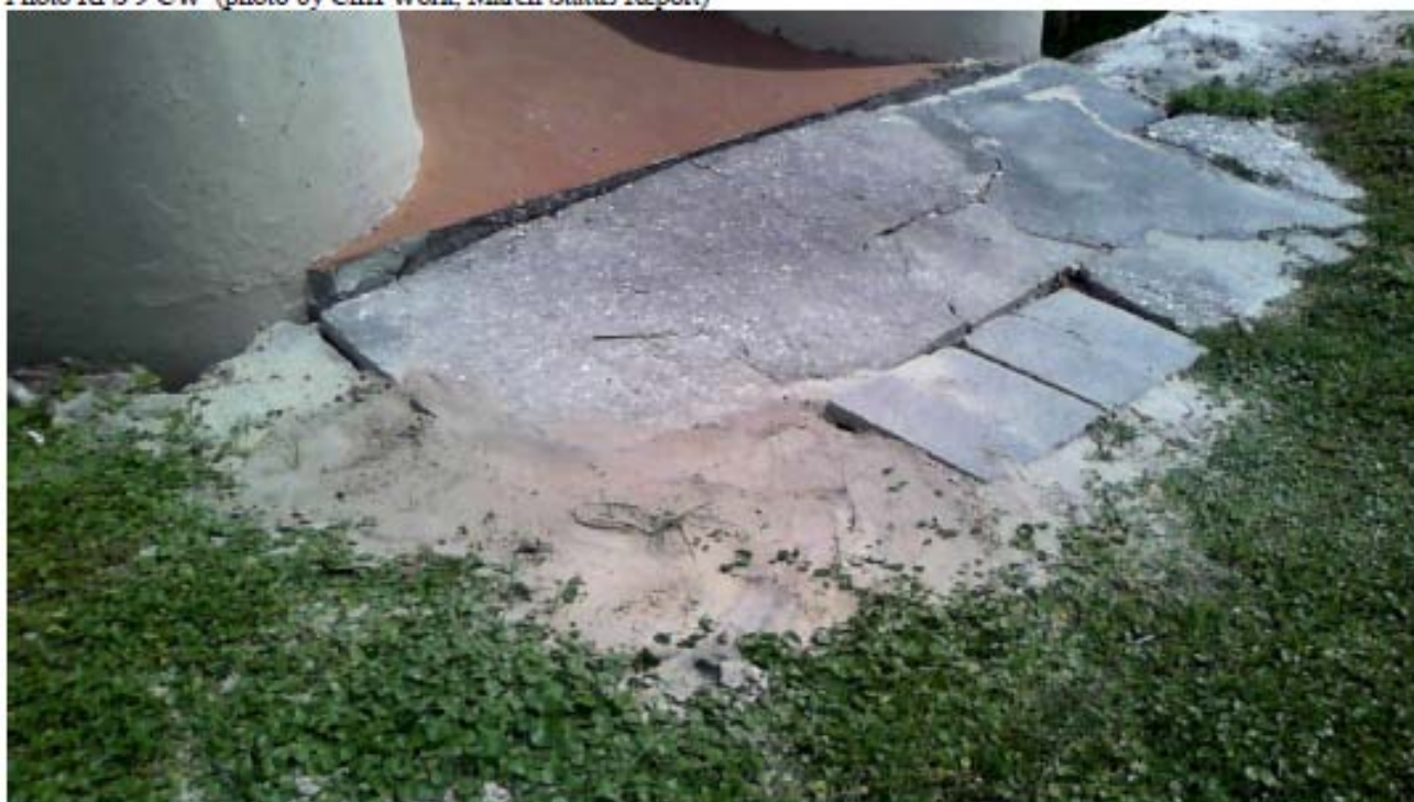
FCCS Division Photo RPS XXX -- From Division's Items to be Corrected Issue List and related Photos