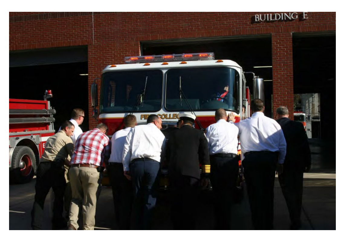
New fire truck dedication and push-in ceremony January 5, 2017 at FSFC

In 2002, the Florida Legislature again restructured the statewide organization and created the Department of Financial Services (DFS) that would be operated by the Office of Chief Financial Officer (CFO) which was a combination of the former offices of Comptroller and Treasurer, Insurance Commissioner, and Fire Marshal. Florida's political cycle also has a bearing on how FSFC operates. The tiered government structure is the Office of Chief Financial Officer, Department of Financial Services (elected official; 4-year election cycle), Division of State Fire Marshal (appointed Director and Assistant Director), Bureau of Fire Standards and Training (appointed Bureau Chief and Assistant Superintendent) which operates the Florida State Fire College campus.