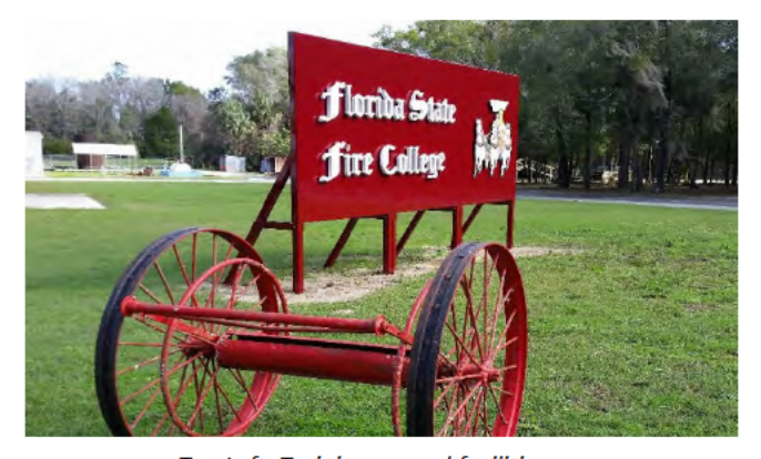
Top Left: Training ground facilities. Bottom Left: Confined Space Prop. Right: Florida State Fire College sign to welcome visitors