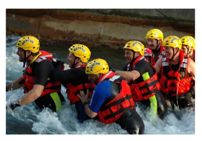
Specialized Swift Water Technician class offered by Marion Technical College (MTC)