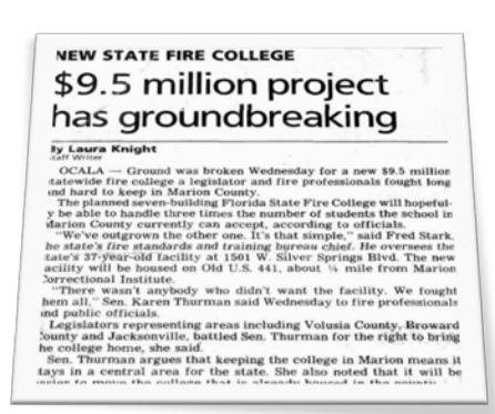
January 20, 1988 article, Ocala Star Banner

on resources that included a large volunteer firefighting population, as well as paidcareer service firefighters, organized firefighting training became more available and was geared to meet the needs of the communities that it served. It was the greatest impact on providing consistent fire service responses to the citizens in this great state.