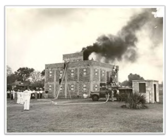
Burn building at original campus

Two important documents were written throughout the history of the Florida State Fire College. The Statewide Organization Design for the Delivery of Fire Service Training and Education State of Florida was written in 1979 and prepared under the direction of the Division of State Fire Marshal. In this document, there are names of participants who leave behind a fire service legacy. They were leaders in different fire service organizations who