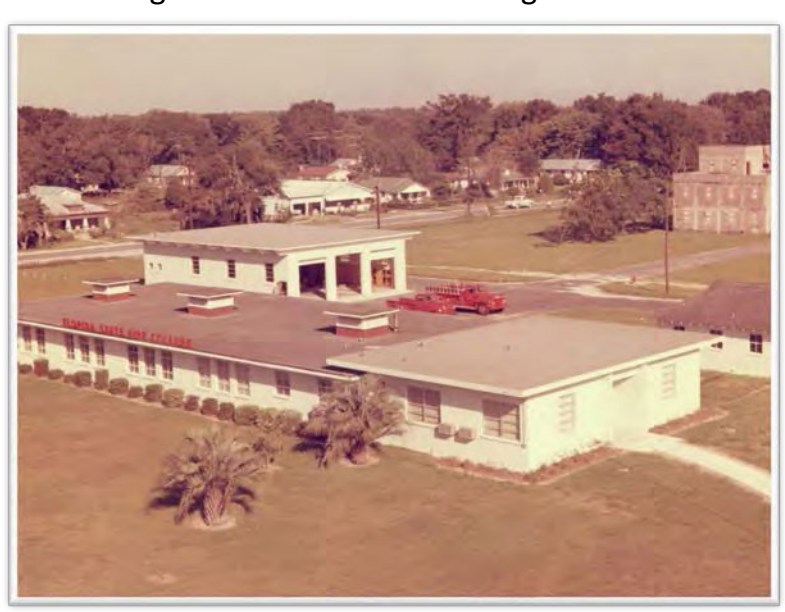
Original FSFC Campus

offering of Florida Fire College Annual fire schools throughout Florida during the 30's and 40's was originally sponsored by the Florida State Firemen's Association, currently known as the Florida State Firefighter's Association. The idea grew for a facility to be centrally located in Florida that would provide training and be a leader for all fire service needs. The Florida State Fire College was created